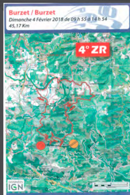
Vainqueurs de la ZR4: RICHTER Franck/ RICHTER Gerhard - #303 Wartburg 311