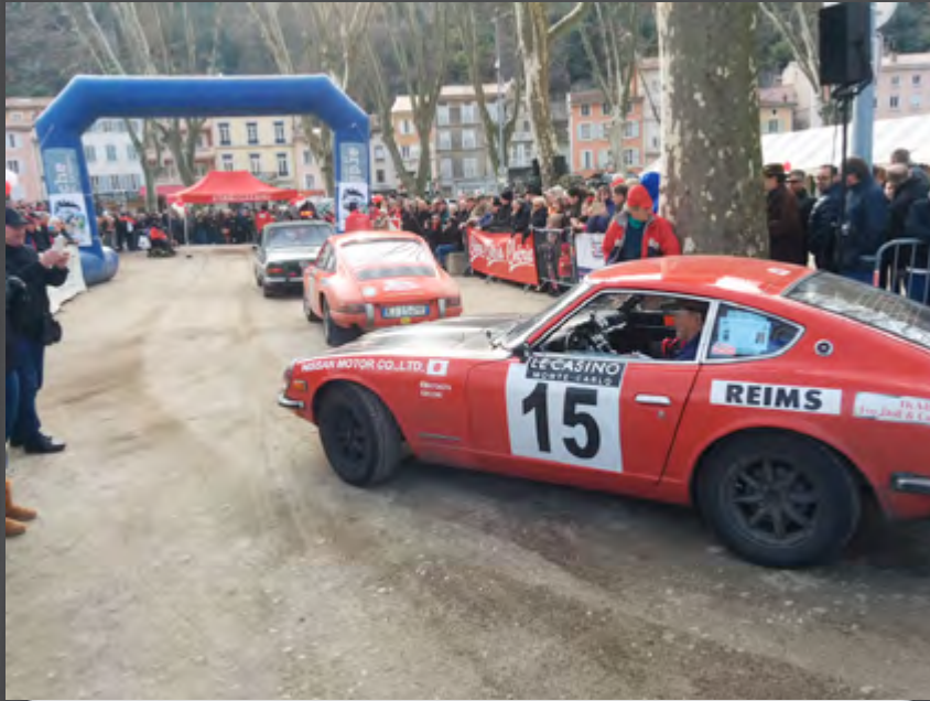
The audience, as usual, was large in Tournon.