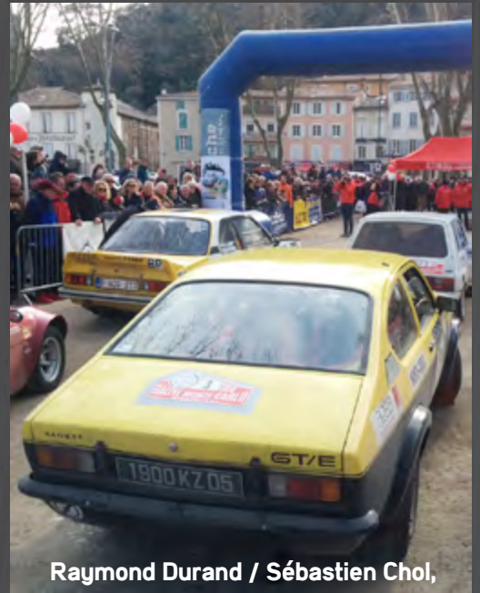
Raymond Durand / Sébastien Chol, finally comes to their turn ?