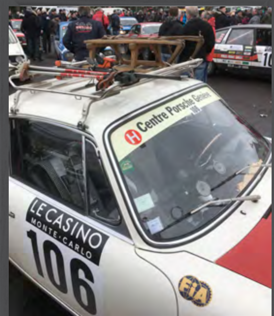
Snow is falling in Ardèche !