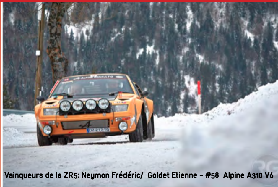
Vainqueurs de la ZR5: Neymon Frédéric/ Goldet Etienne - #58 Alpine A310 V6