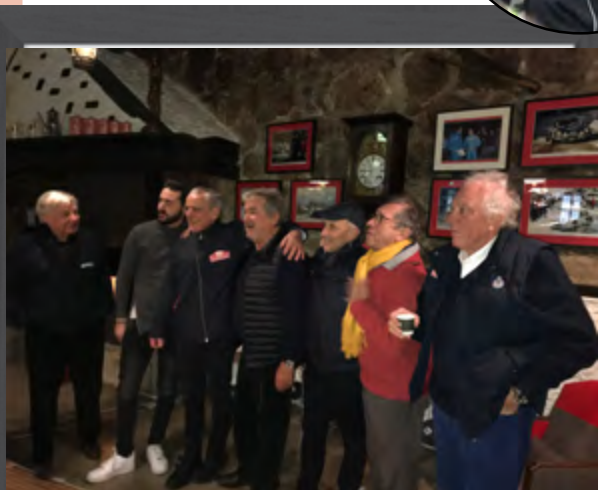
Le Team des Chefs, completely at home !