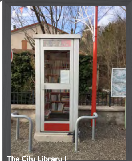
The City Library !