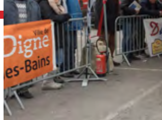
CH de Digne