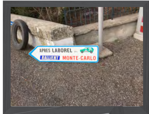
A village of Rally Fans ?