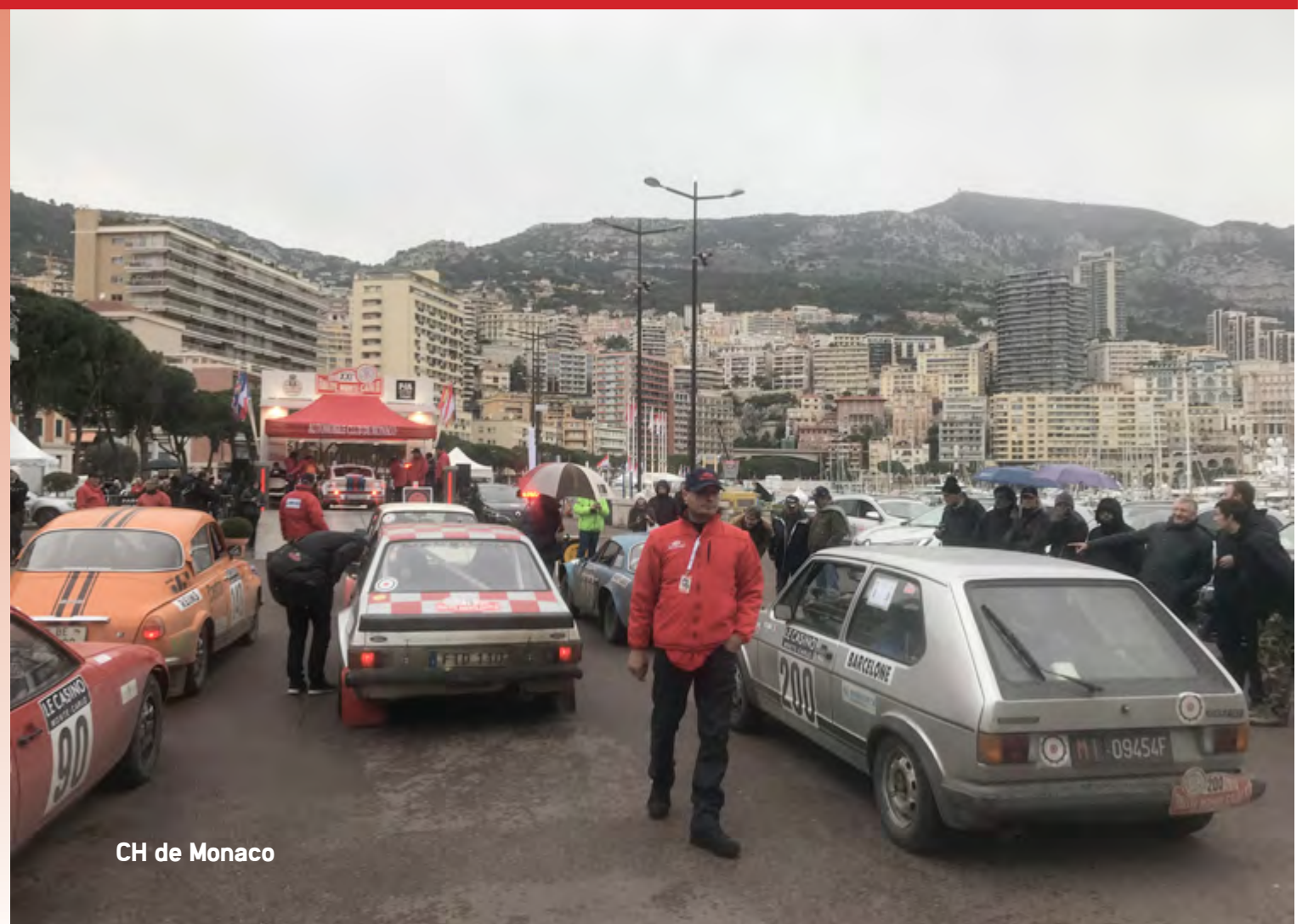
CH de Monaco